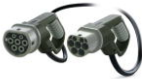
Charging cable, Connector, Plug, Charging cable with plug, IEC 62196-2 (type 2), Length: 4 m, Color of outer sheath: black, Number of phases: 3, Charging mode: Mode 3

Please be informed that the data shown in this PDF Document is generated from our Online Catalog. Please find the complete data in the user's documentation. Our General Terms of Use for Downloads are valid ( http://download.phoenixcontact.com )